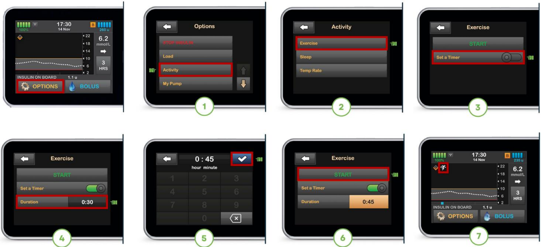
Illustration of how to set the Exercise mode on the t:slim X2 Control-IQ system

Moser et al (2024) Diabetologia DOI 10.1007/s00125-024-06308-z